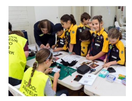
Figure 3 - SARC Electronics Team

boarding circuits and soldering kits like experts. Their "Hypnotic Owl" project with flashing blue LED eyes was a big hit and many children, who had never soldered before, sat down and gave it go.