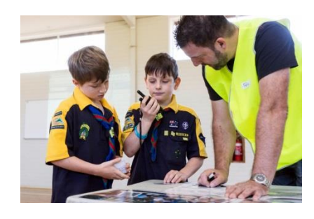
Figure 8 – "Can I have my rig back?"

Meanwhile any and all amateurs roaming around with handheld radios were encouraged to hand them over to any children in their vicinity and to help them get on the air: Some for the very first time. Radio procedure flash cards ensured that everything was above board. The result was a lot of chatter on 2m FM simplex with most enjoying the experience so much it was actually quite hard to get the radios back!